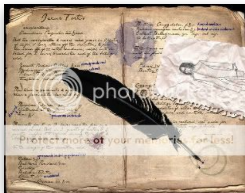
Caption: Hermione's notes (in blue) on a copy of Severus's lecur Fortis potion recipe. Illustration by Hechicera.

In the last two days she had also helped Professor Slughorn brew and bottle the lecur Fortis potion. It was fascinating. The brewing itself was not so complicated, but the purifying process was incredibly difficult, picky work. Hermione could turn out a passable version of the potion, but with practice, she knew she could learn to extend its effectiveness for hours, even days.